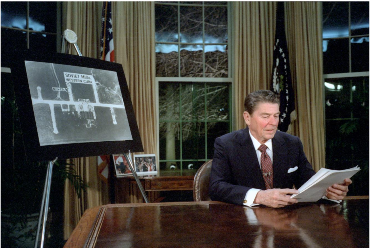
Picture 1: President Ronald Reagan addresses the Nation from the oval office on National Security (SDI Speech) 23.3.1983